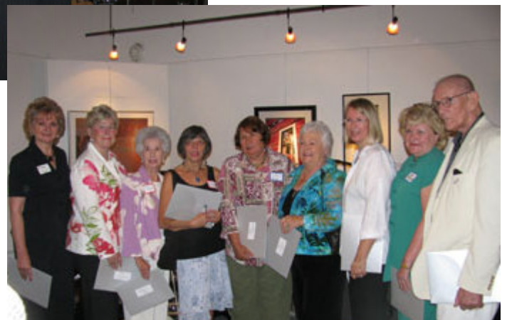
The award winners at the April 2009 Open Transparent Show at Art Center Manatee.